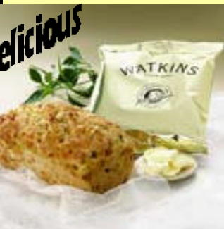
Delicious Cheese Pleasers Bread

Heat oven to 375° F. Spray loaf pan with Watkins Cooking Spray . Combine Bread Mix with seasonings and grated cheese in large mixing bowl. Add club soda and mix until blended, do not over mix. Spoon batter into pan. Drizzle butter over dough and sprinkle with Watkins Sea Salt . Bake 50 minutes. Cool slightly & serve! Delicious as an appetizer dipped in Watkins Garlic & Parsley Grapeseed Oil . If you like it hot & peppery... dip in Watkins Black Pepper Grapeseed Oil . This bread completes a meal when served with soup like Broccoli & Cheddar (see recipe below).